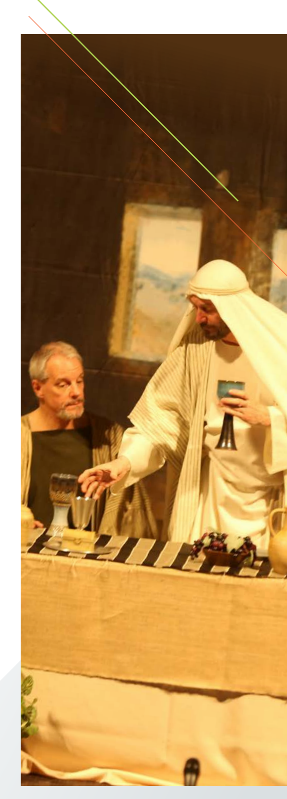
St. John's Lutheran Church

Midweek Advent services were shared using the Holden Evening Prayer . The team partnered with other ministry teams to offer hospitality during the Christmas at the Mansions event at Ewing Manor. Visitors enjoyed carolers and hot chocolate. The Christmas Eve schedule and Children's Christmas Experience were promoted during this event. The Blue Christmas service offered people an experience of healing during the holidays. St. John's Choir performed the cantata The Christmas Light , a musical piece consisting of well-known classical melodies and hymns that walked through Advent and the birth of Christ.